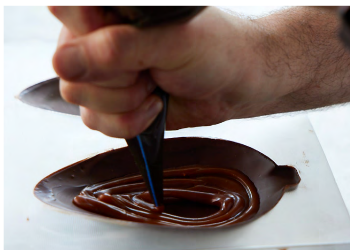
Magnolia petal-shaped chocolate mold by Philip Khoury.