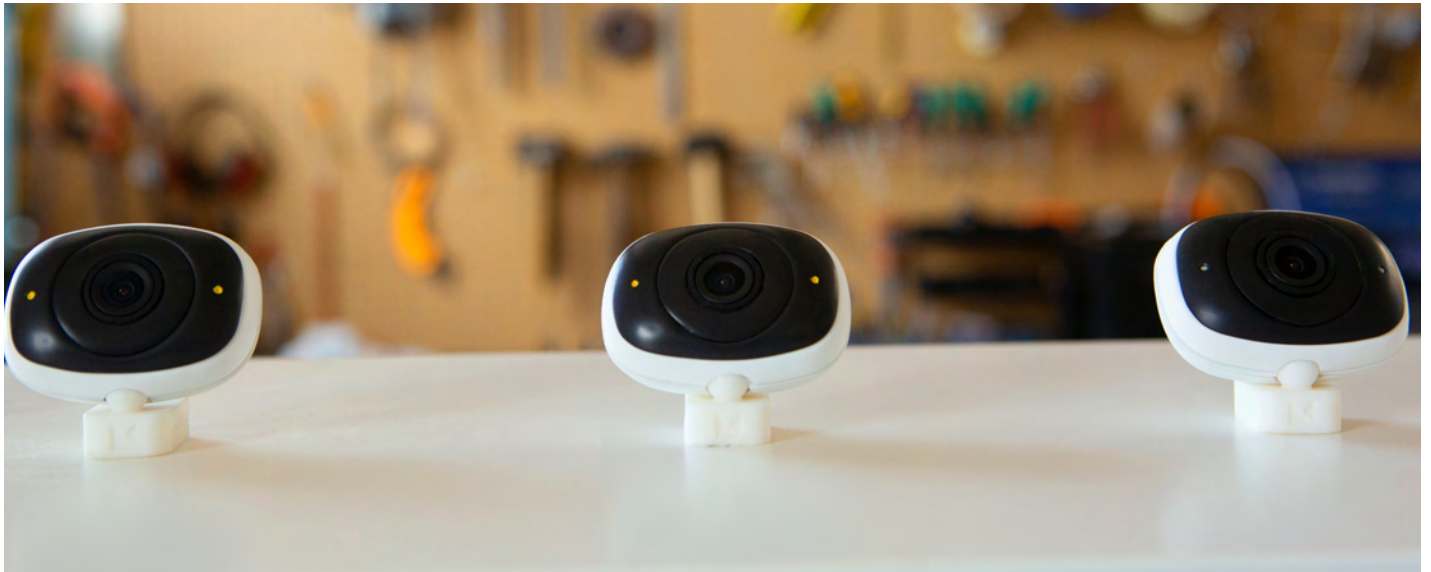
Webcam casings by Beta Design Office.