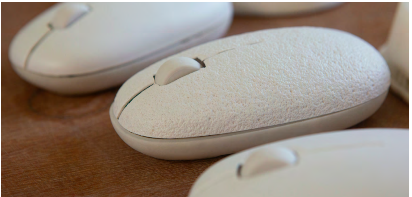
Mouse casings by Beta Design Office.