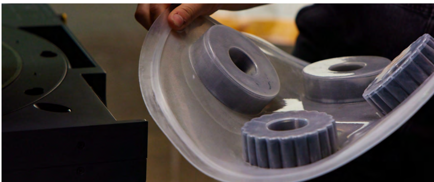
'Noughts & Crosses' games pieces designed by Nona Living.